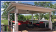
Custom Decks & Roof Structures

17% off & 5% off Retractable Awnings All Construction Must be presented at time of final consultation. Expires 2/28/18 Not valid with other offers or prior services.