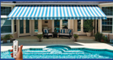
Motorized & Manual Retractable Awnings

The Area's Premier Design & Build Company