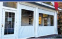
Sentry Retractable Walls & Screens